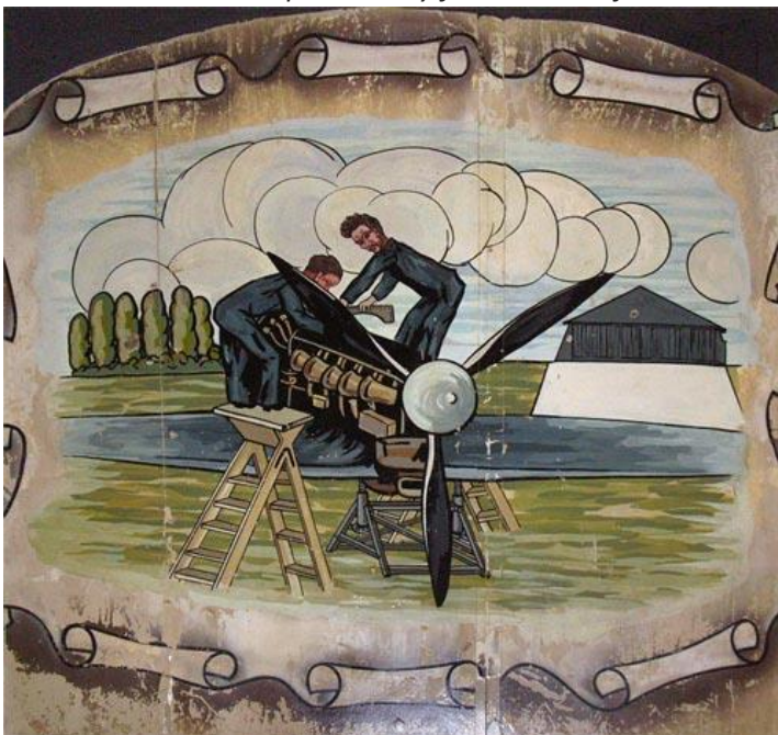
Mural at Starveal Farm – working on a Spitfire. From WW2 Airfields of Oxfordshire

A Satellite Landing Ground is typically an airfield with one or two grass runways which is designed throughout to be "hidden" from the sky by using woods and other natural features to hide the presence of aircraft and associated buildings. The landing grounds were mainly used by RAF maintenance units which used the areas to disperse aircraft to reduce the likelihood of attacks from the air. – Wikipedia entry for location of Satellite Landing Grounds.