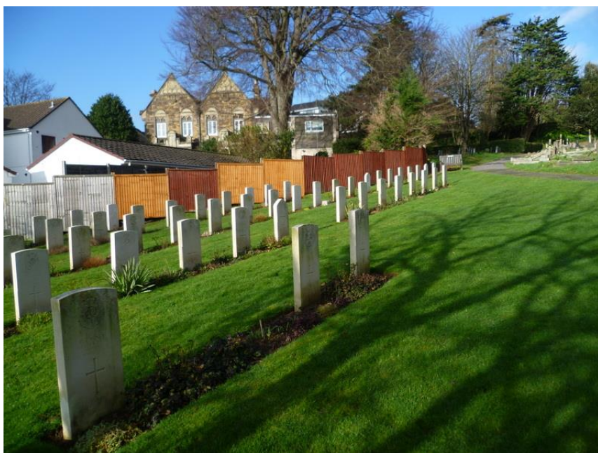
WESTON SUPER MARE WAR GRAVES CEMETRY