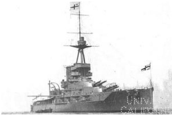
HMS Marlborough, Iron Duke class battleship