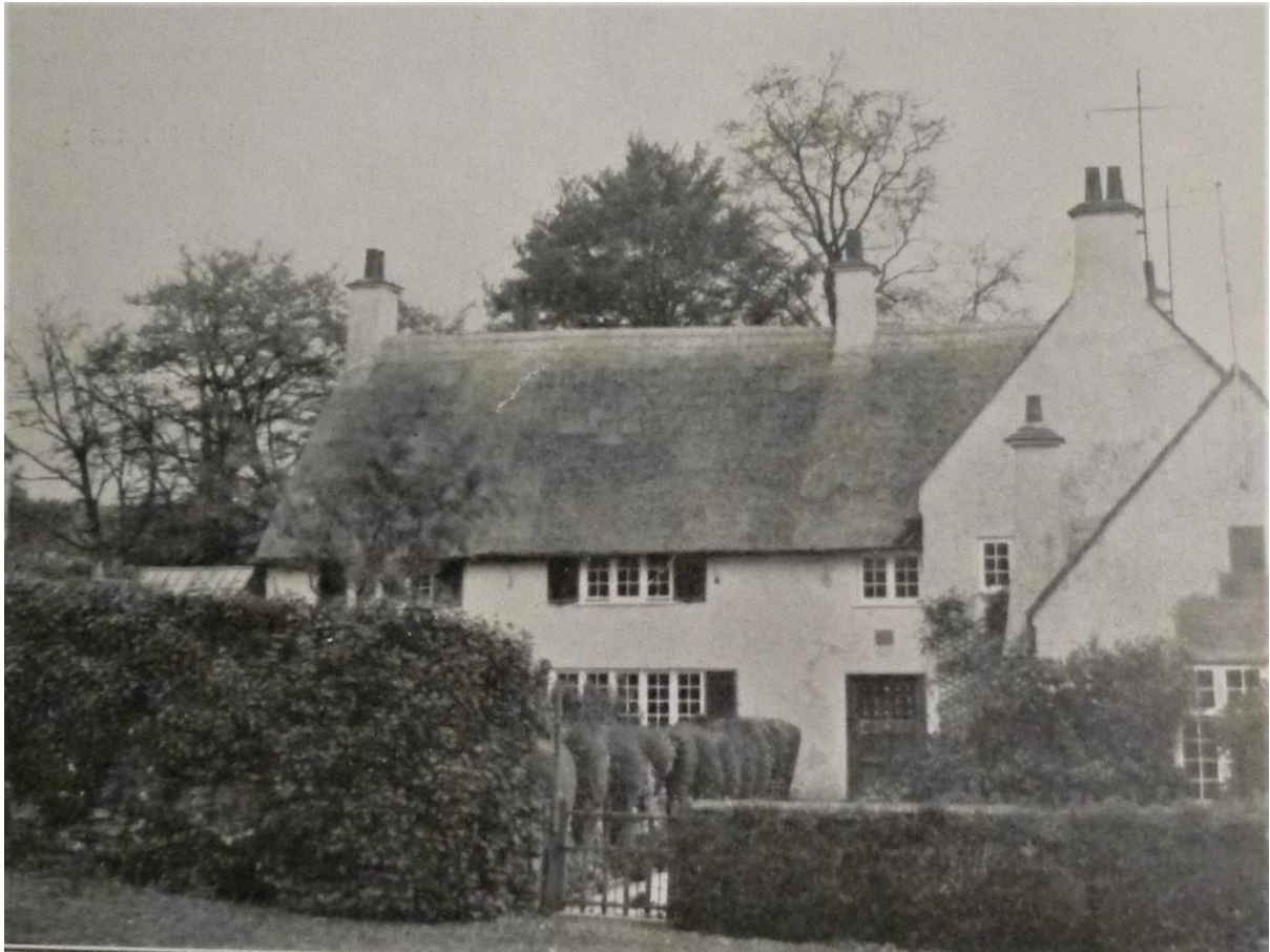
The Grange from the south