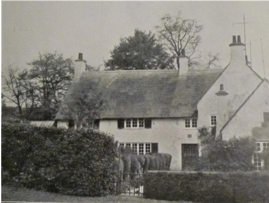
The Grange, Buckland St Mary