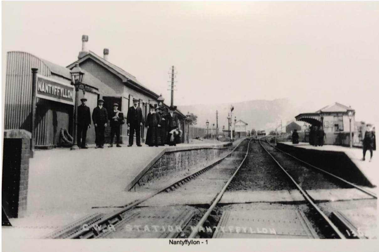
Nantffyllon - 1