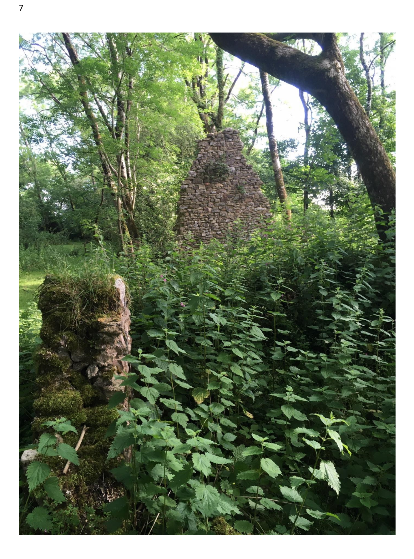
Britty Farm Ruins 2020