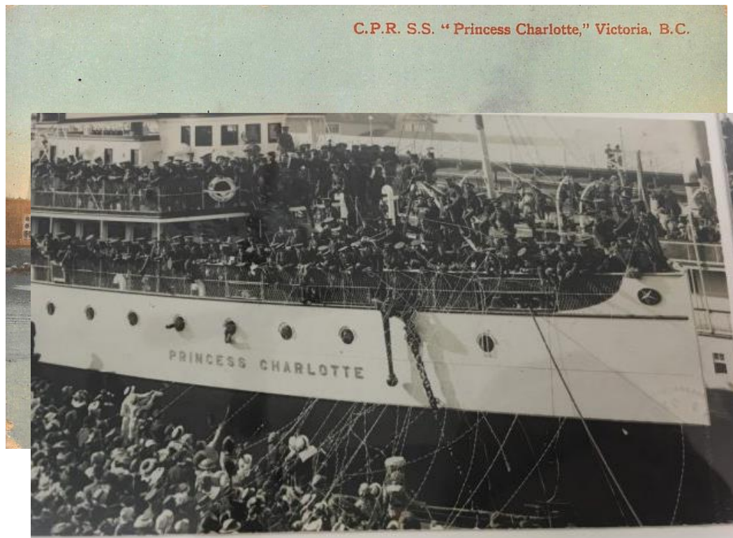
(below) 88 th Battalion boarding SS Princess Charlotte in Victoria Harbour, British Columbia

The Battalion received marching orders on 20 th May 1916 which were received with cheers of enthusiasm from officers and men. Three days later the first units of the Battalion sailed to the UK aboard the SS Princess Charlotte . Others followed on the White Star Liner Olympic a week later.