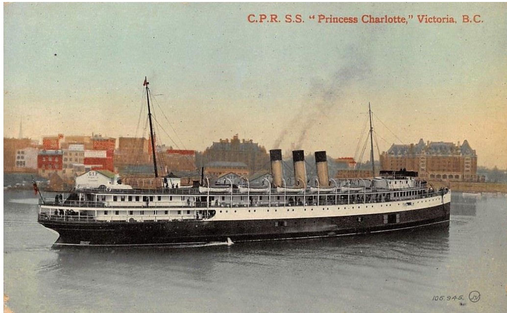
(below) 88 th Battalion boarding SS Princess Charlotte in Victoria Harbour, British Columbia