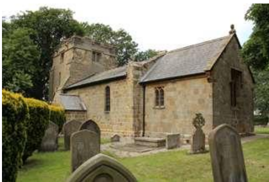
St Oswald's, Newton-Under-Roseberry

He died aged 80 in 1977, and his wife in 1979. They were living then at Pinchinthorpe Hall, Guisborough, Yorkshire, and are buried in St Oswald's Churchyard.