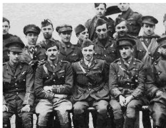
Enlargement of above photo