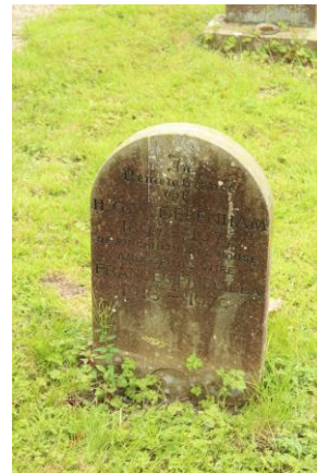
Headstone in St Oswald's churchyard