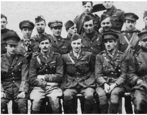
Enlargement of above photo

On 8 th May 1918 he was promoted to Temporary Captain and two days later was posted to 208 Squadron as a flight commander. The Squadron, formerly the No. 8 Naval Squadron, had come into being on 1 st April, 1918 on the amalgamation of the Royal Flying Corps and Royal Naval Air Service to form the Royal Air Force. Whilst with 208 Squadron he shot down one further enemy aircraft - in May 1918.