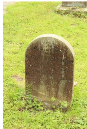
Headstone in St Oswald's churchyard