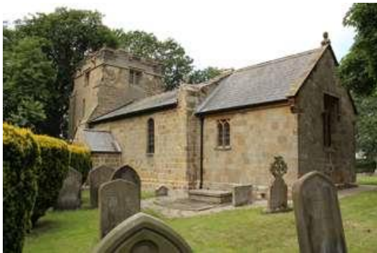
St Oswald's Church, Newton-Under-Roseberry