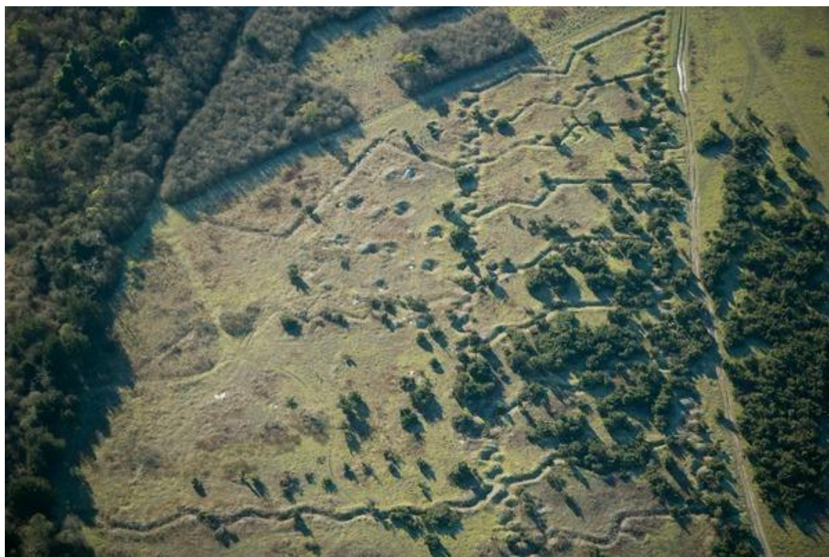
WWI PRACTICE TRENCHES ON SALISBURY PLAIN AT BULFORD