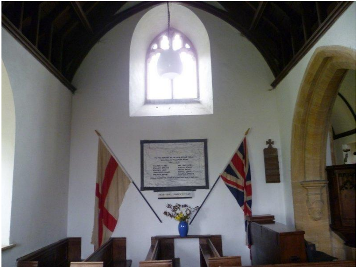
OTTERFORD CHURCH MEMORIAL