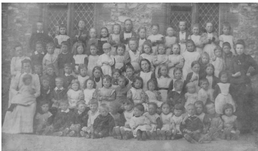
Buckland St Mary School