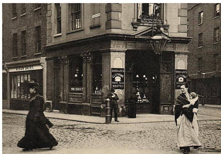
Great Earl Street, 1895