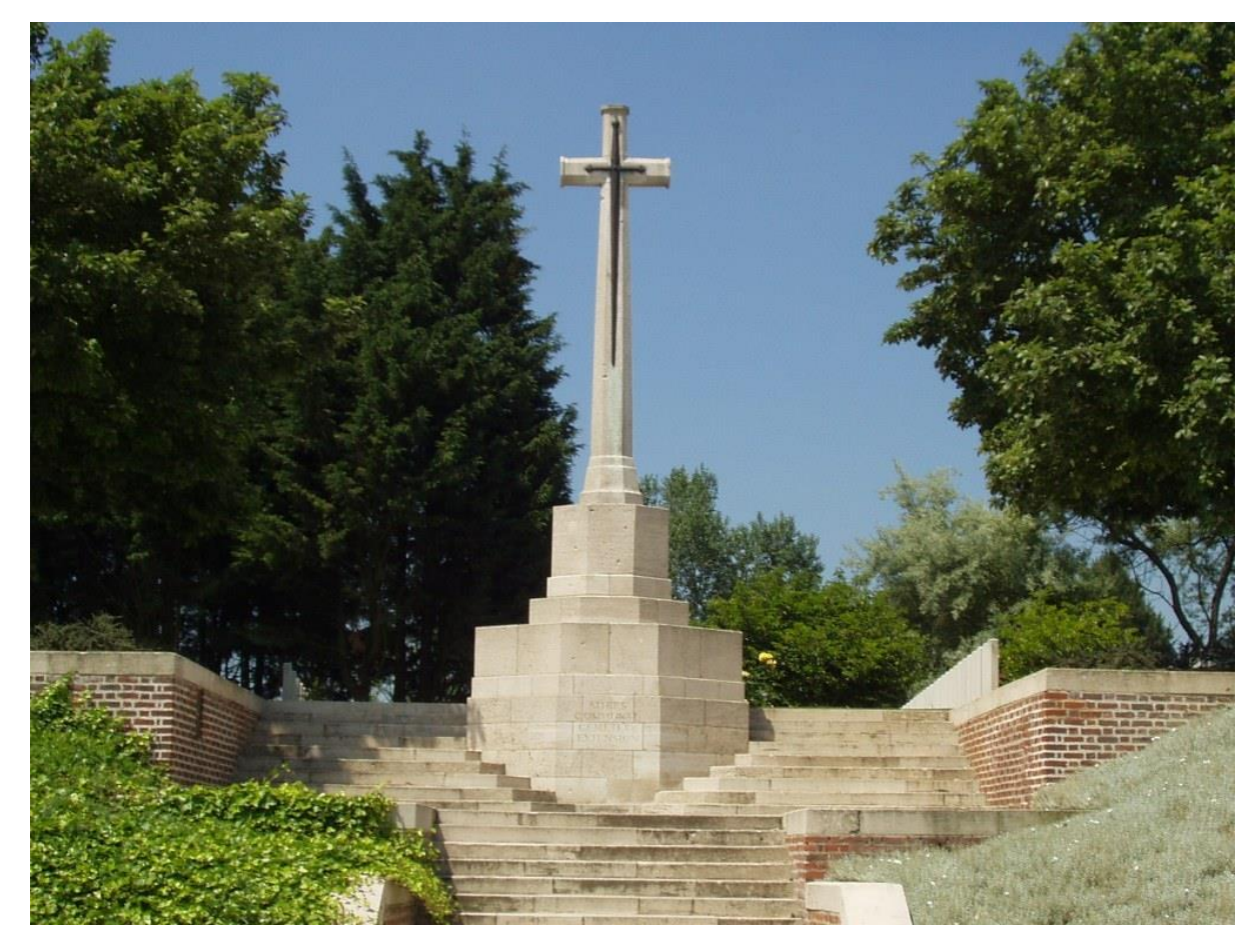
Athies Cemetery Communal Extension – Pas de Calais